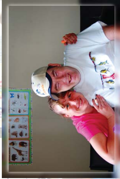
One on one....or in a group.

We offer programs for Developmentally/ Physically challenged youth and adults, as well as students ages 13-20 during P.A. days, March break and Summer Holidays.